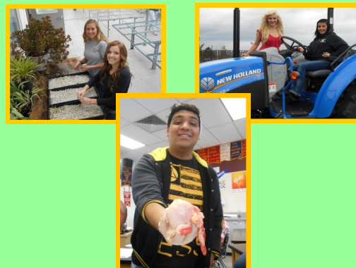
Agriculture Science students at RHS