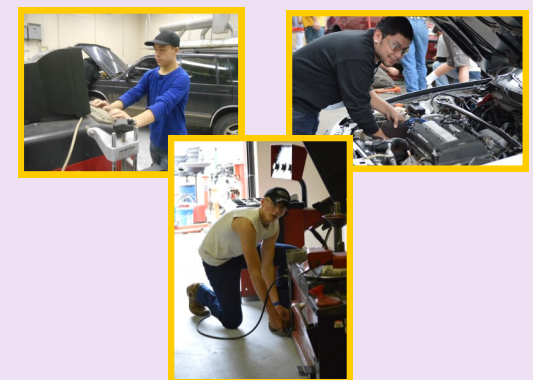
Automotive Technology students at RHS