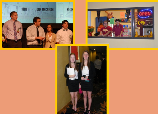
Business & Management students at RHS