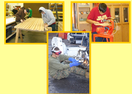
Construction & Manufacturing Technology students at RHS